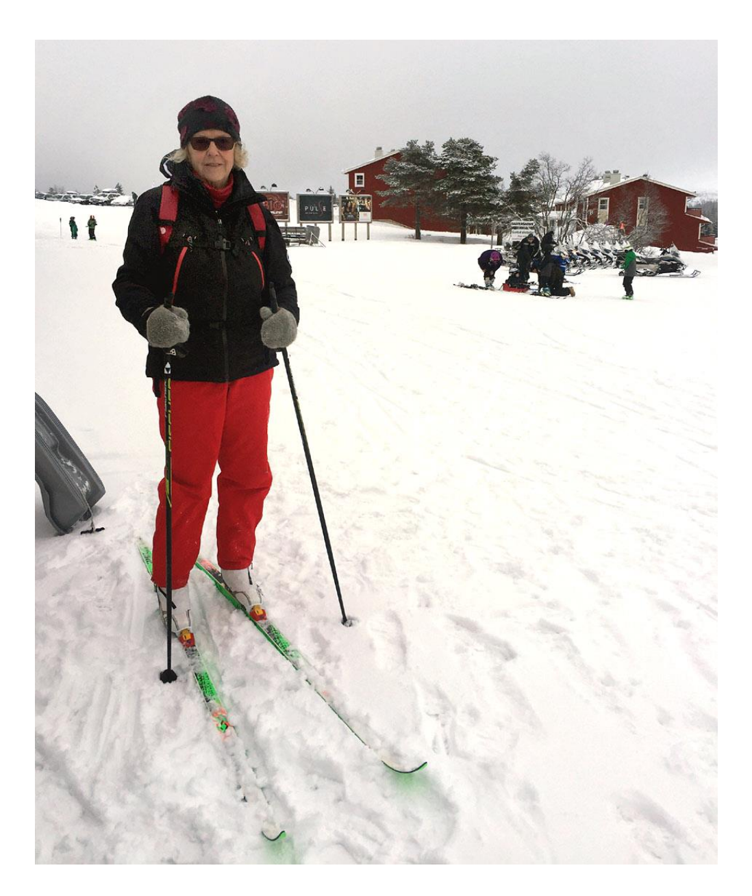
February Skiing in Sälen, Dalarna.