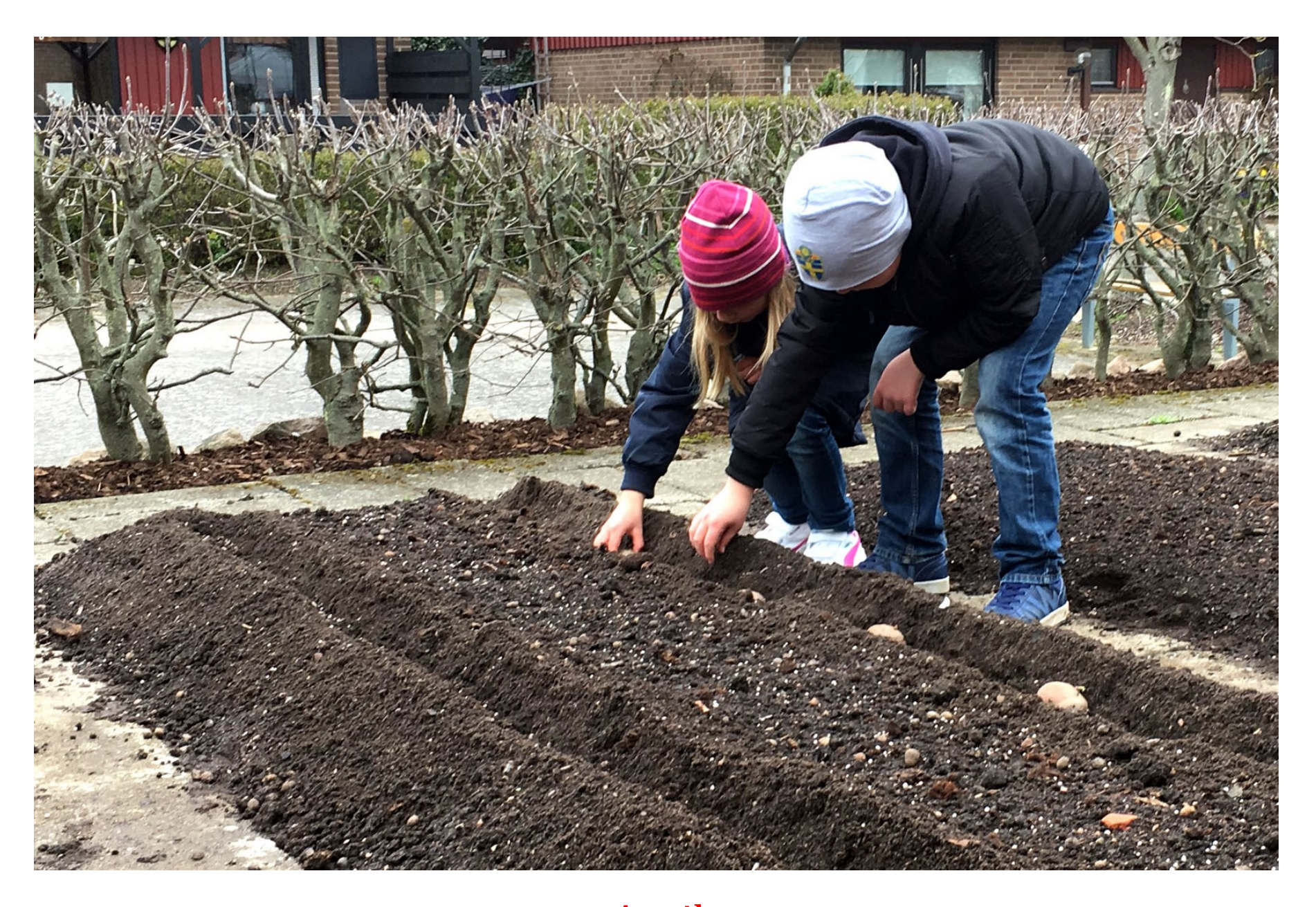
April Traditions passed on. Yes, the crop came out fine.