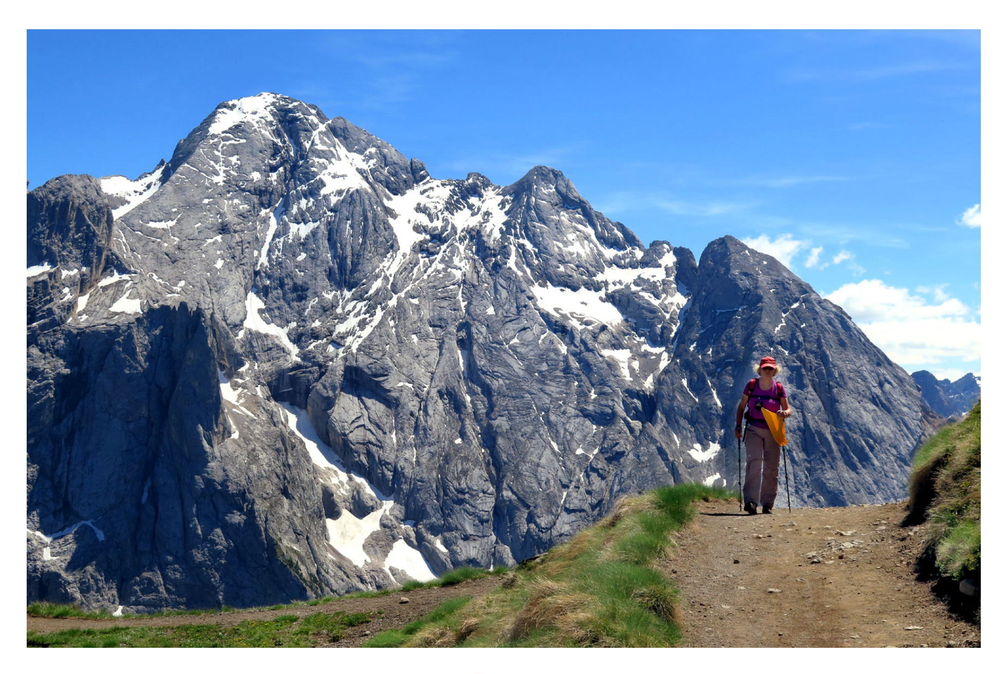
June Tough but wonderful hiking in the Dolomites, Italy.