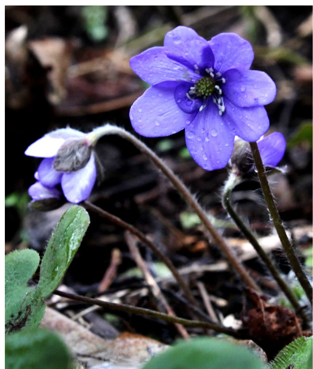
March Signs of spring.