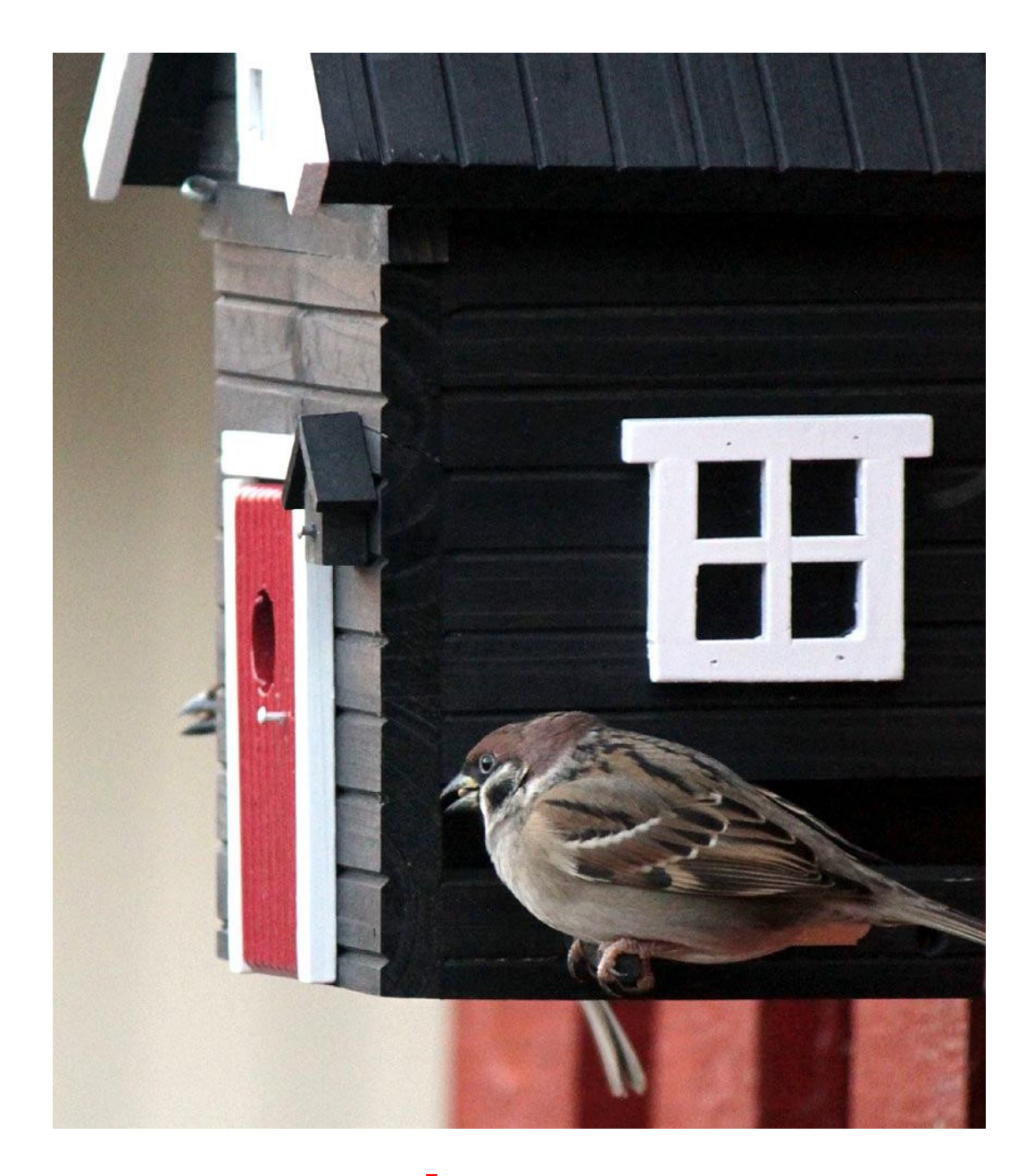
January The sparrows like their new lunch spot.